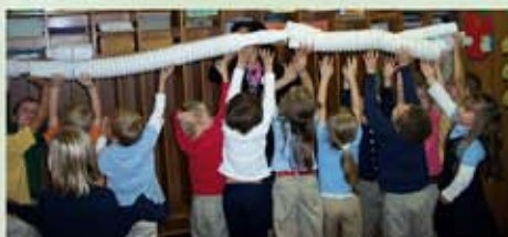
Simulating the construction of a chipmunk burrow.

Students will learn chipmunk and bird behavior, as well as photography tips. They will be motivated to explore nature, and to use their own writing, photography or artwork to create stories.