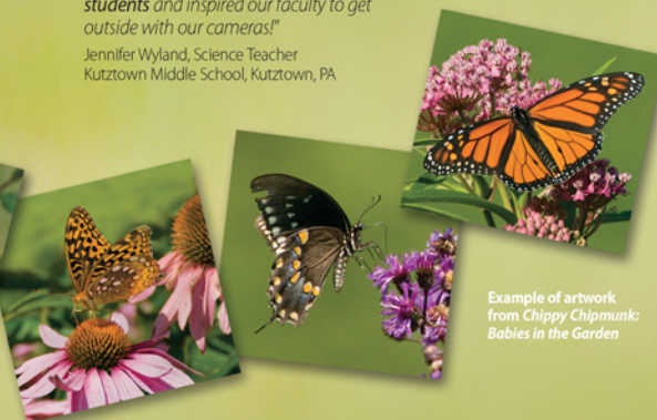
Example of artwork from Chippy Chipmunk: Babies in the Garden